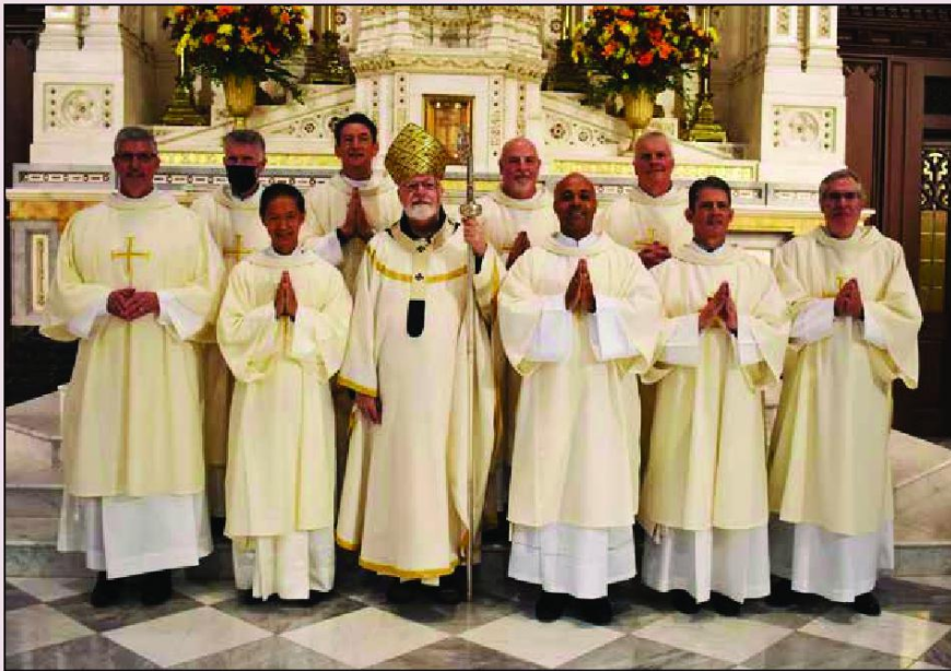
Cardinal O'Malley joins with nine new deacons for a group photo at the Cathedral on Saturday, October 15, 2022 after the ordination Mass. The new deacons come from all over the Archdiocese and will be assigned to parish duties.