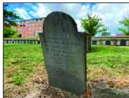
Continued on page 3

Halloween is approaching, and so is this year's Haunted Graveyard Tour at the South End Burying