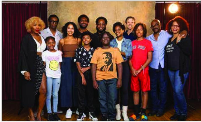
The cast of Joe Turner’s at The Huntington.