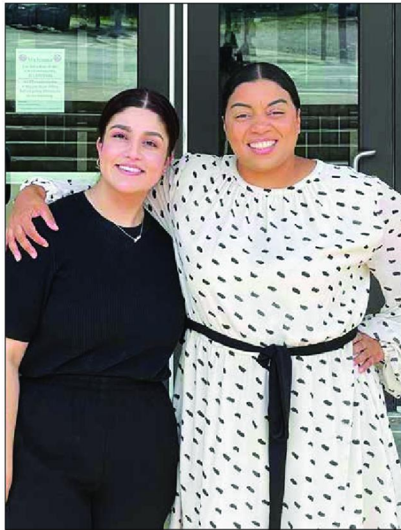
Maliha Khan and Senator Liz Miranda.

Senator Liz Miranda represents the newly redistricted 2 nd Suffolk District with neighborhoods in Roxbury, Dorchester, South End, Mattapan, Hyde Park, Mission Hill, Jamaica Plain, Roslindale and the Fenway.