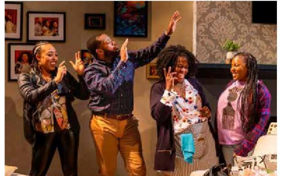
The family breaks into dance awaiting Grandma at her birthday party in Jackie Sibbles Drury's "Fairview" at SpeakEasy Stage Company.

Fairview, SpeakEasy Stage Company, Roberts Studio Theatre, Calderwood Pavilion, Boston Center for the Arts, Boston, through March 11. 617-933-8600 or bostontheatrescene.com