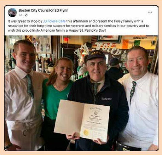
MORE PHOTOS ON PAGE 6