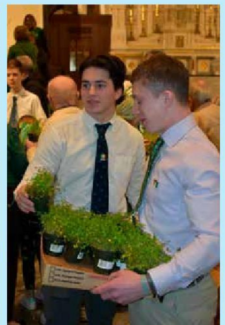
Boys from Catholic Memorial took part in the Mass and helped distribute shamrocks after to the crowd.