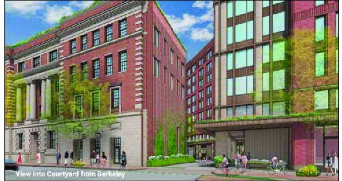
View Into Courtyard from Berkeley