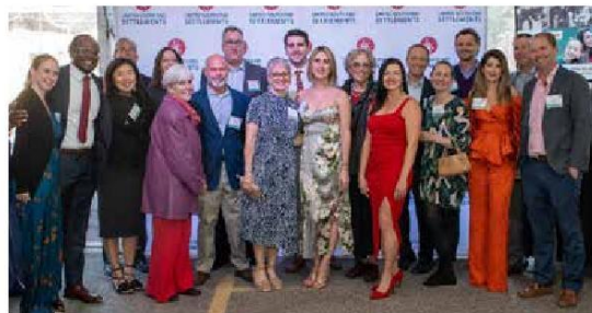
USES's 2023 Neighborhood Gala Host Committee.

The United South End Settlements (USES) Neighborhood Gala held on Thursday, May 18 raised nearly $1.2 million dollars. USES is continuing to fundraise to reach their goal of $1.3 million to commemorate their 130th year. Over 400 guests attended the gala to celebrate the USES community in its 130th year and recognize individuals who have made a significant