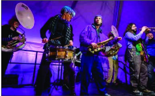
The Party band is one of the many artists that will be performing at Fête de la Musique on June 24th.

Community Music Center of Boston presents Fête de la Musique, on Saturday, June 24 from 2-5 pm.