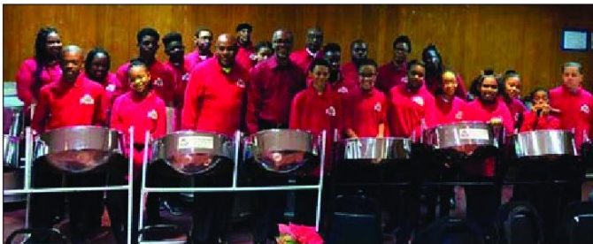
Branches Steel Orchestra.

More information at cmcb.org/wp-event/fete-de-la-musique/