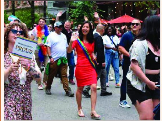
Mayor Michelle Wu.