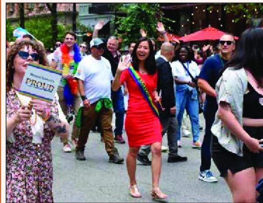
Mayor Michelle Wu.