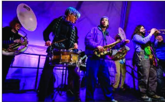
The Party band is one of the many artists that will be performing at Fête de la Musique on June 24th.

Community Music Center of Boston presents Fête de la Musique, on Saturday, June 24 from 2-5 pm.