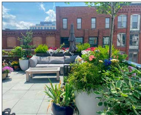
South Ender Salil Sharma wins the 'Porch Balcony or Container Garden' category.