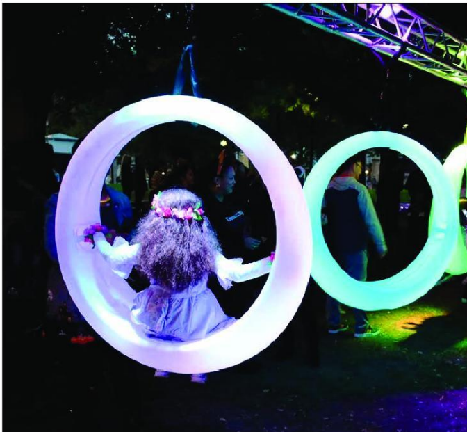
The Glow in the Dark Park with LED swings, LED seesaw, and LED corn hole was a big hit at the October 20 Fall-O-Ween family festival hosted by the Boston Parks and Recreation Department.