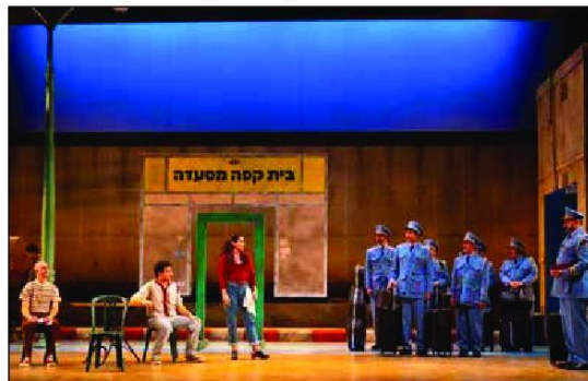
Cast members of Huntington Theatre-SpeakEasy Stage Company production of "The Band's Visit".

The Band's Visit , Huntington Theatre and SpeakEasy Stage Company, Huntington Theatre main stage, Boston, through December 17. 617-266-0800 or huntingtontheatre.org