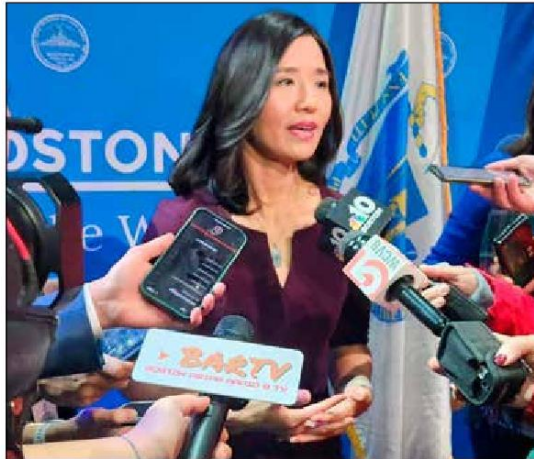
Boston Mayor Michelle Wu spoke to reporters after the 2024 State of the City.