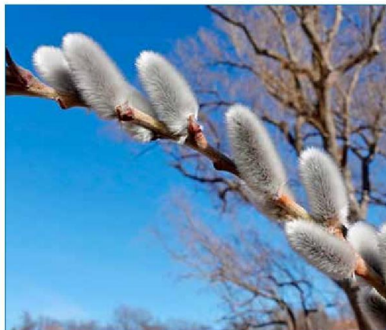
Catkin of rosegold pussy willow before flower emergence.