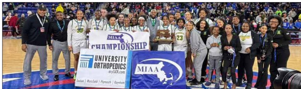
The Cathedral Panthers - D4 girls basketball team defeated South Hadley on Monday, March 18th to secure their MIAA State Championship for the second year in a row.