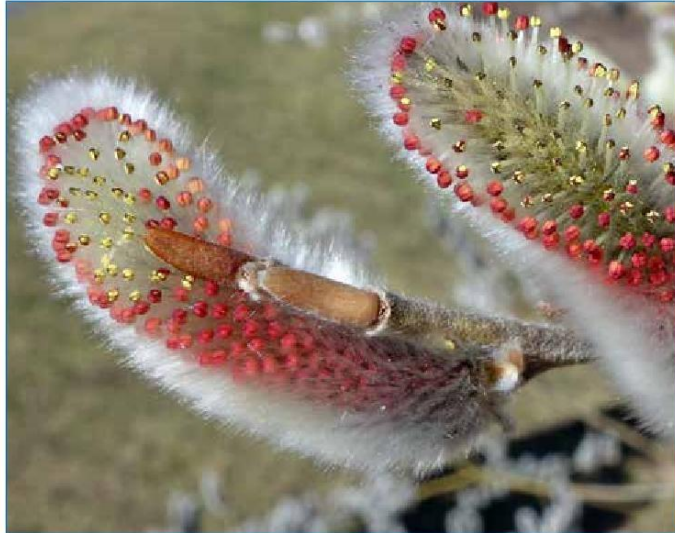
Male flowers emerge on rosegold pussy willow

Learn more about willows and Boston's museum of trees at arboretum.harvard.edu . Open every day. Free every day.