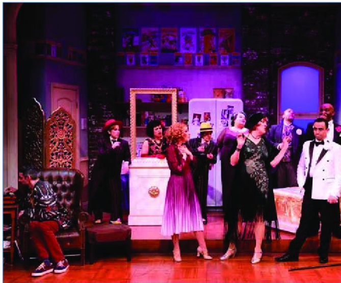
The cast of The Drowsy Chaperone.

Quite simply, Lyric Stage's rousing revival of "The Drowsy Chaperone" is an intoxicating pleasure.