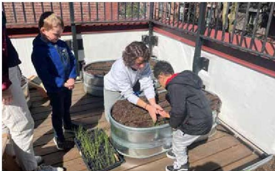
Ellis Early Learning students plant vegetables on the roof deck garden at Ellis in the South End with the help of Green City Growers.

"We hope the positive effects of this program reach beyond the classroom, making nutritional food and healthy eating habits more accessible to both Ellis students and their families," said Ellis Early Learning CEO