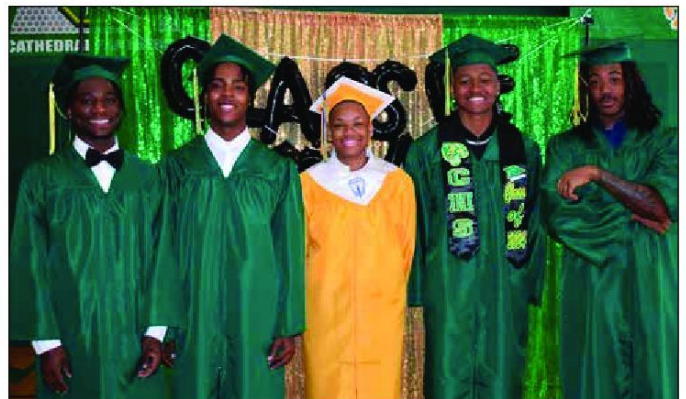
Graduating seniors on the basketball team get together for a final team picture.