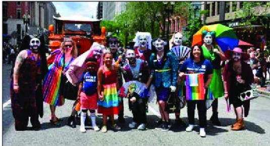
Pride Parade 2023.

Boston Pride For The People (BP4TP) announced the theme of the 2024 Pride Parade and Festival, which will take place on Saturday, June 8, 2024. "Still Here: In Living Color" is a nod to historic and current-day resilience in fighting anti-LGBTQ+