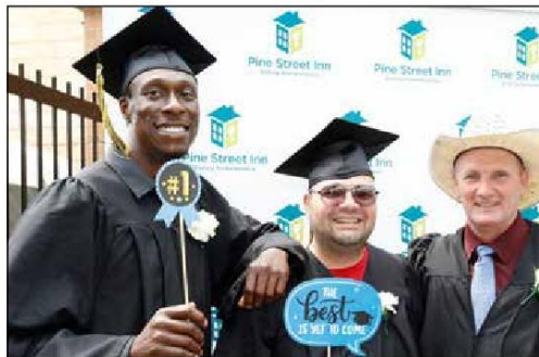
Trainee graduates pose as they prepare for Friday's Pine Street Inn workforce development program graduation ceremony.