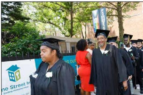
Trainee graduates take part in a processional leading to Friday's Pine Street Inn workforce development program graduation ceremony.