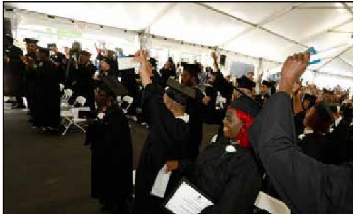
Trainee graduates celebrate at Friday's Pine Street Inn workforce development program graduation ceremony.