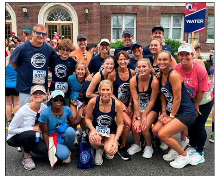
Team BCP

products to patients and their families who need it. The practice was created with a mission to provide equitable pediatric healthcare to all children throughout the area regardless of insurance or a family's ability to pay.