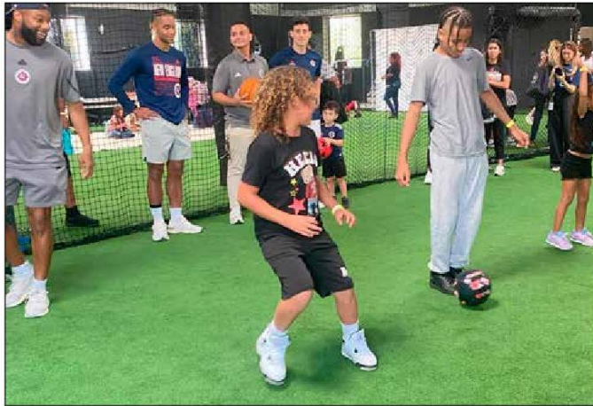
Players from the New England Revolution playing soccer with the children in attendance.

NCL Wellesley, all the volunteers, and the dedicated BCP staff and interns for their unwavering commitment and hard work.